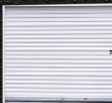
9' Roll-up Garage Door