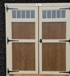
Transom Windows added to Wooden Doors

Prices are subject to change at any given time.