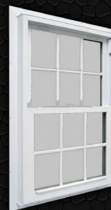
2' x 3' Thermal Window