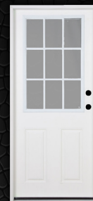
9 Lite 36" Door