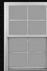
2' x 3' Window