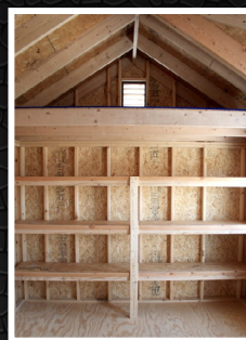
Example of Shelving