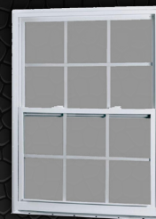
3' x 3' Window