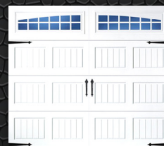
Carriage House Garage Door